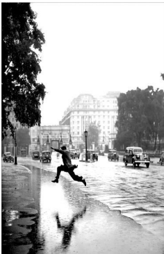
London, Marble Arch