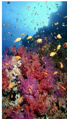
A Dive in Sharm El Sheikh