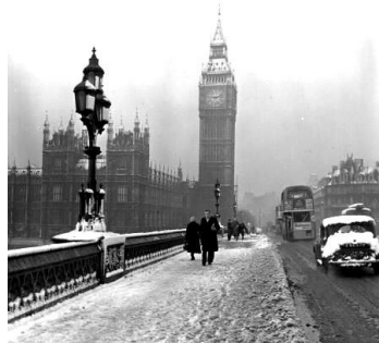
Westminster in Snow