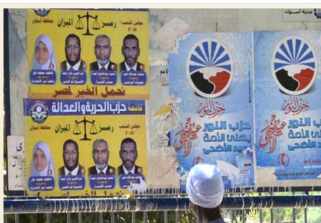
Election Banners for the FJP and Nour Party

The concern for many is the possible allegiance between the FJP and the Military Council. If they decide to play footsie, they have every opportunity to advance their own interests. The FJP is in a position to protect the Council against any hostilities because they are backed by the popular vote. A