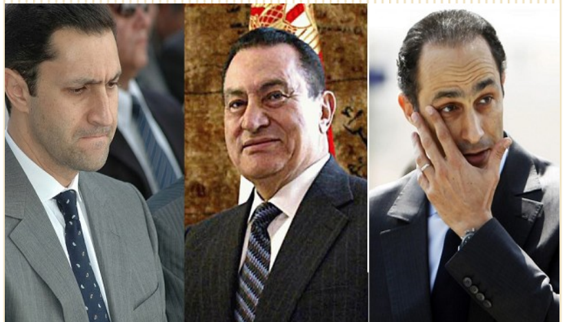
Under Investigation: Hosni Mubarak (centre) and his two sons, Alaa (l) and Gamal (r)