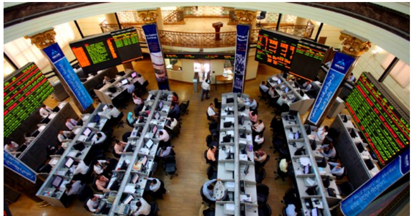
Egypt's Cairo Stock Exchange

The military, to which President Hosni Mubarak handed power after he stepped down on 11 February, has said it